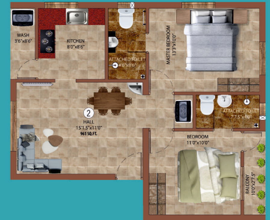
TYPICAL FLOOR PLAN (First, Second & Third Floor, - B Block)