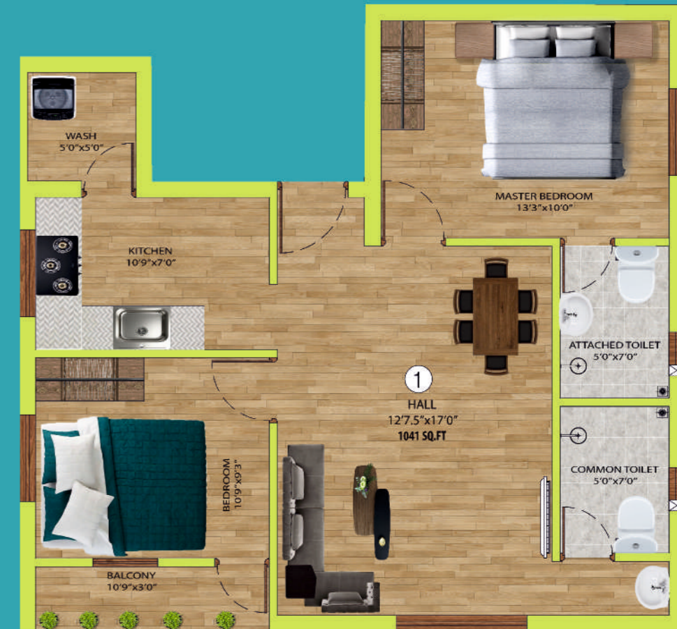
TYPICAL FLOOR PLAN (First, Second & Third Floor, - A Block)