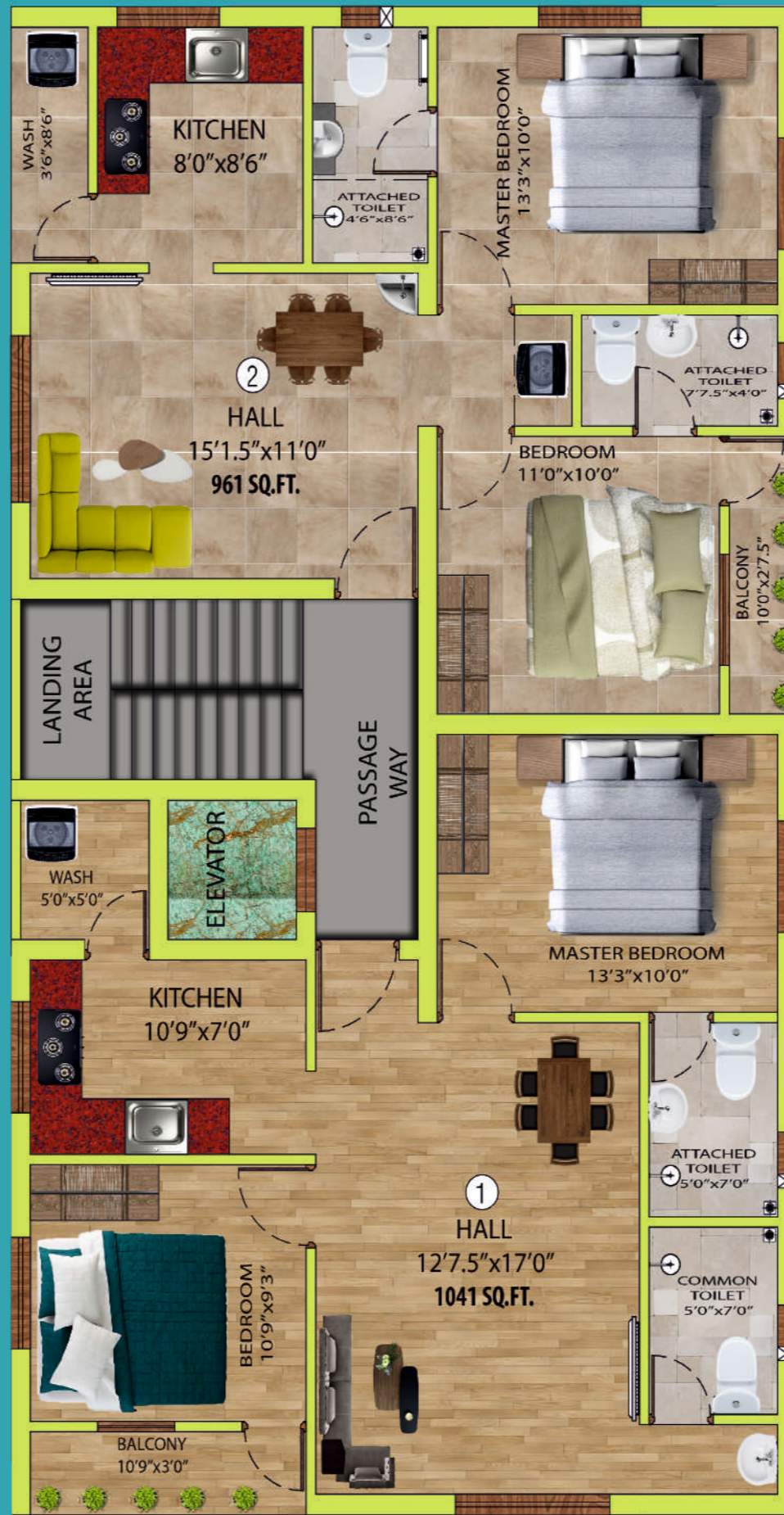
ROAD TYPICAL FLOOR PLAN (First, Second & Third Floor)