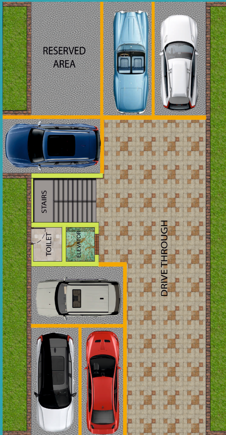
ROAD STILT FLOOR PLAN